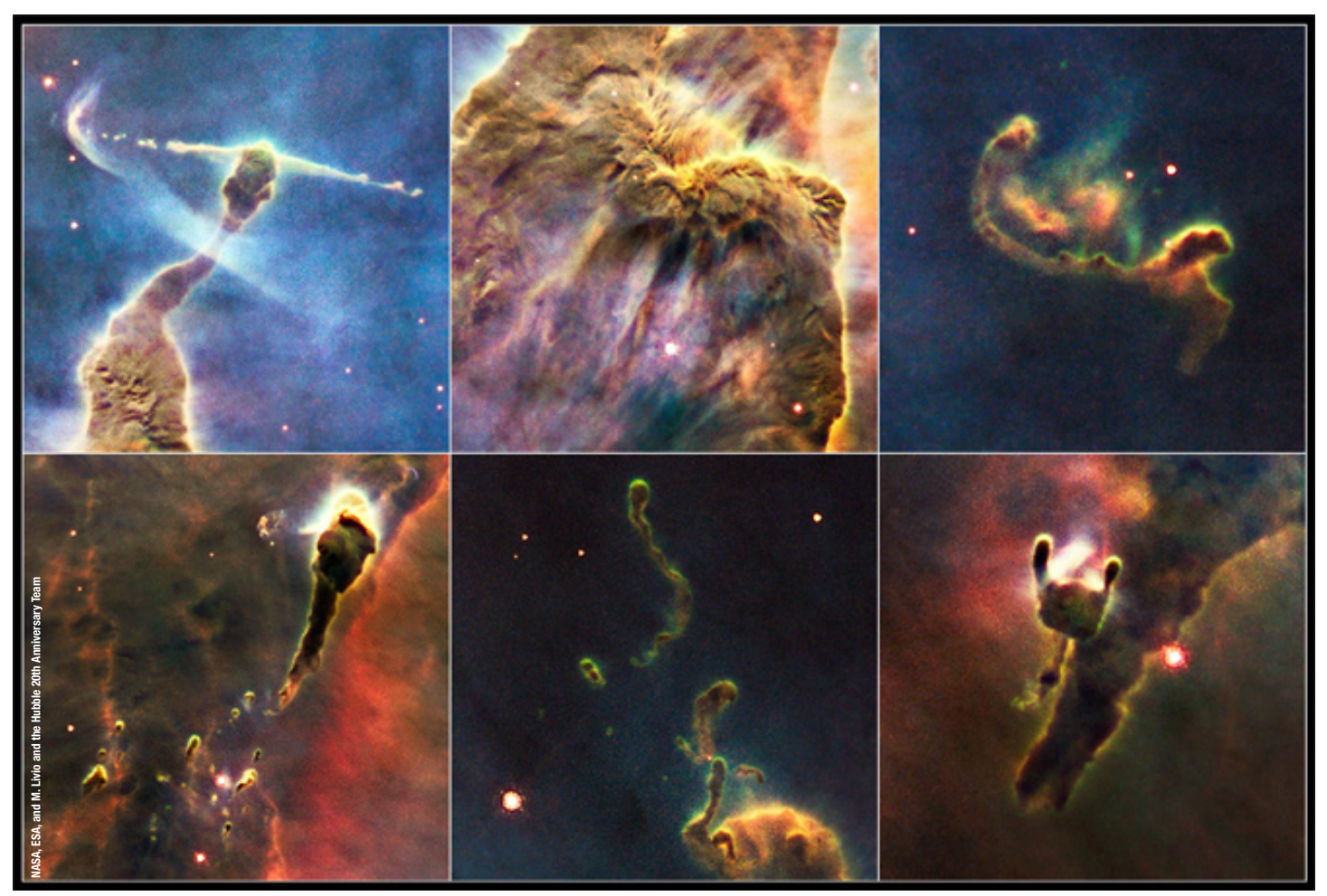
This is a series of close-up images taken by Hubble of the complex gas structures in a small portion of the Carina Nebula. The nebula is a cold cloud of predominantly hydrogen gas laced with dust, which makes the cloud opaque. It is being eroded by a gusher of ultraviolet light from young stars in the region. They sculpt a variety of fantasy shapes, many forming tadpole-like structures. In some frames,

Wright is the Marshall Center historian in the Office of Strategic Analysis & Communications.