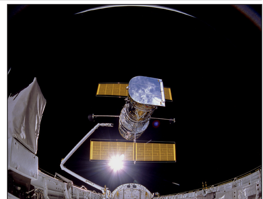
The Hubble Space Telescope was deployed April 25, 1990. The photograph was taken by the IMAX Cargo Bay Camera mounted in a container on the port side of space shuttle Discovery during the STS-31 mission.

As NASA prepared for delivery of the final elements of the telescope that same year, Marshall's Jim Odom, then