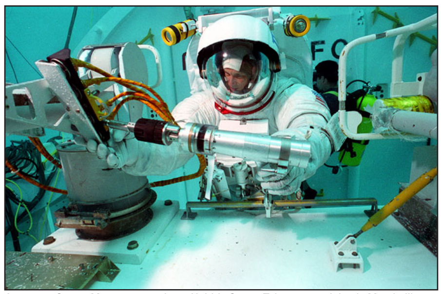
Astronaut Storey Musgrave conducts Hubble Space Telescope training in Marshall's Neutral Buoyancy Simulator in 1993.